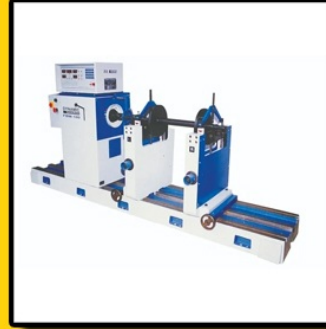
DYNAMIC BALANCING MACHINE