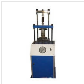
Spring Testing Machine