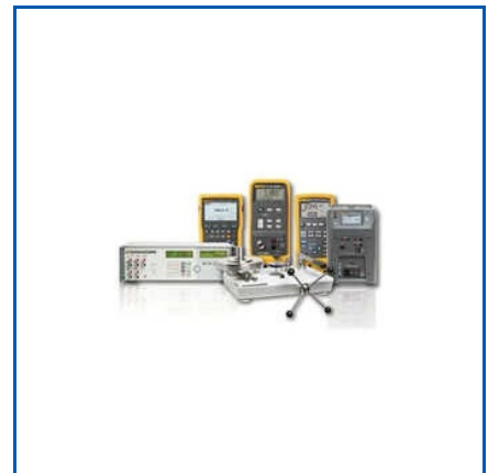
INSTRUMENT CALIBRATION SERVICES