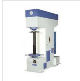
Brinell Hardness Testers