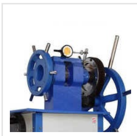
Erichson Cupping Tester