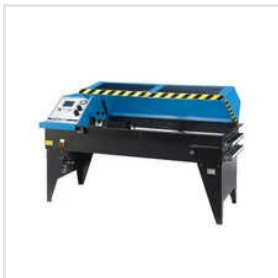
Pressure Testing Machines