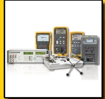
INSTRUMENT CALIBRATION SERVICES

Brinell Hardness Testers, Compression Testing Machine Calibration, Computerized Brinell Hardness Testing Machines, Computerized Universal Testing Machine, Digital Display Micro Hardness Testers, Digital Portable Dynamic Hardness Tester, Digital Torsion Testing Machine, Dynamic Balancing Machine, Electronic Extensometer, Electronic Universal Testing Machines, Erichson Cupping Tester, Horizontal Chain Rope Testing Machine, Impact Testing Machine Calibration, Instrument Calibration Services, Machine Calibration Services, etc.