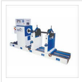
Dynamic Balancing Machine