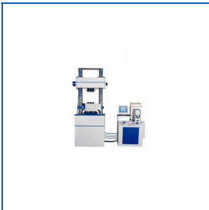
COMPRESSION TESTING MACHINE CALIBRATION

Brinell Hardness Testers, Compression Testing Machine Calibration, Computerized Brinell Hardness Testing Machines, Computerized Universal Testing Machine, Digital Display Micro Hardness Testers, Digital Portable Dynamic Hardness Tester, Digital Torsion Testing Machine, Dynamic Balancing Machine, Electronic Extensometer, Electronic Universal Testing Machines, Erichson Cupping Tester, Horizontal Chain Rope Testing Machine, Impact Testing Machine Calibration, Instrument Calibration Services, Machine Calibration Services, etc.