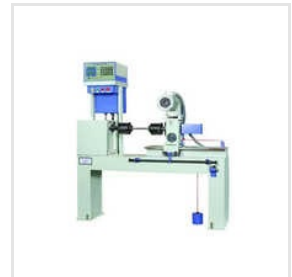
Digital Torsion Testing Machine