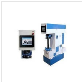
Computerized Brinell Hardness Testing