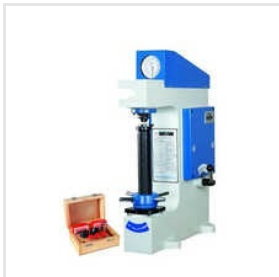
Rockwell Hardness Tester