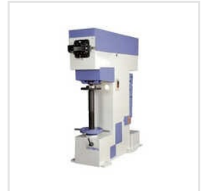
Optical Brinell Hardness Tester