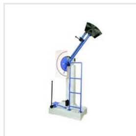
Impact Testing Machine Calibration