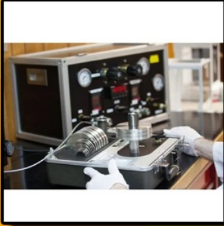
MACHINE CALIBRATION SERVICES