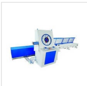
Horizontal Chain Rope Testing Machine