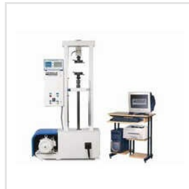
Tensile Testing Machine Calibration