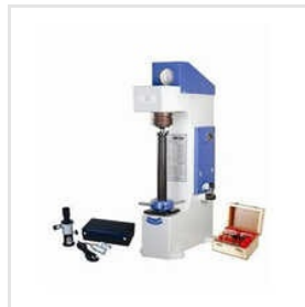
Rockwell Cum Brinell Hardness Testers