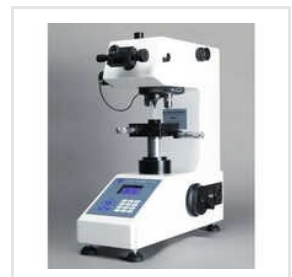
Digital Display Micro Hardness Testers